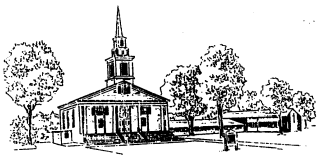
CHEPACHET UNION CHURCH CHEPACHET, RHODE ISLAND 02814

NON-PROFIT ORG. U.S. POSTAGE PAID Permit No. 2 Harrisville, RI 02830